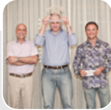
GOLD COAST 2012