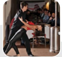
GOLD COAST 2015